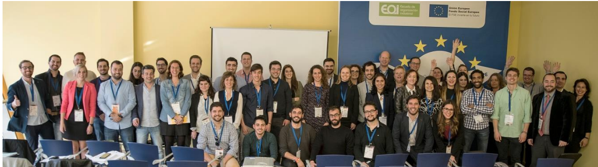
Photo: Wrap-Up Event European Coworkings Programme 1 st edition. European Mentors and Spanish Entrepreneurs coming together and sharing experiences! Málaga, Spain. February 2017

-WRAP-UP EVENT: Once the whole mentoring process is finished, each entrepreneur should come up with a final Business Pitch that will be presented during the final wrap up event to an Assessment Committee composed of several EU hosting centres mentors.